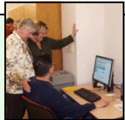
Top: A screen shot of the new Website.

Check back often to see what's new in Family Social Science.