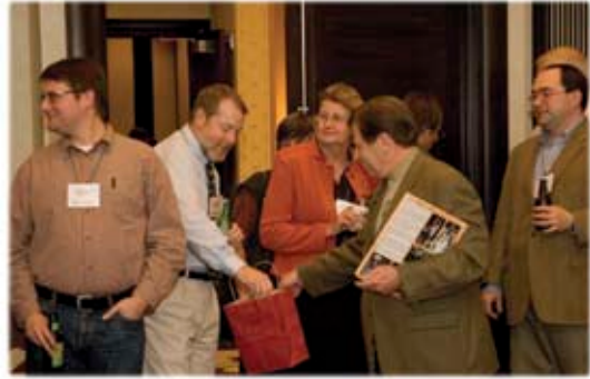
Drawing for prizes.