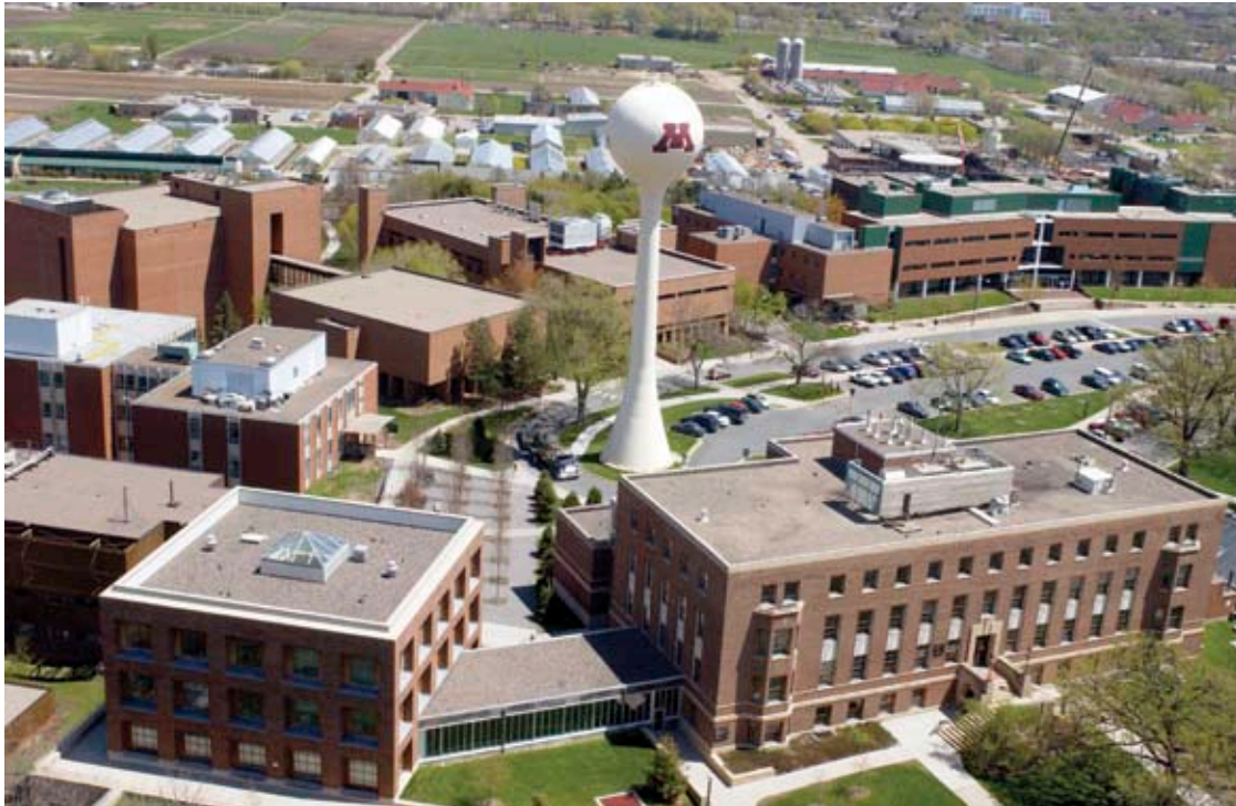
Aerial shot of St. Paul Campus showing Hodson Hall in the upper left.

Web page: http://www.entomology.umn.edu/