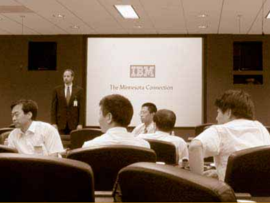
Members of the Beijing delegation visit the IBM headquarters in Rochester