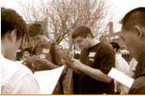
High school students embark on a treasure hunt to China-related destinations on campus.