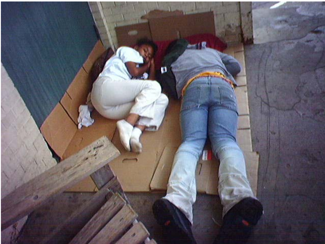
Front walkway entrance to YouthLink, going into my office.

And to the people on the streets in the Twin Cities, your stories, your situations, brought and continue to bring me humility daily. It seems like the main difference between me and you are God's grace and mercy.