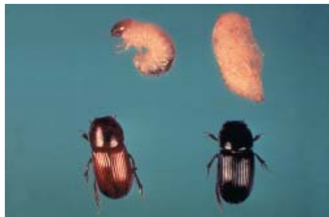
Black turfgrass Ataenius larva, pupa, and adults. (217)

Raster of an Ataenius beetle grub. The hind end of the grub is called the raster. It contains sutures and hairs used to identify the grub species.