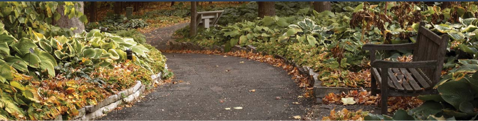
Hosta Glade.