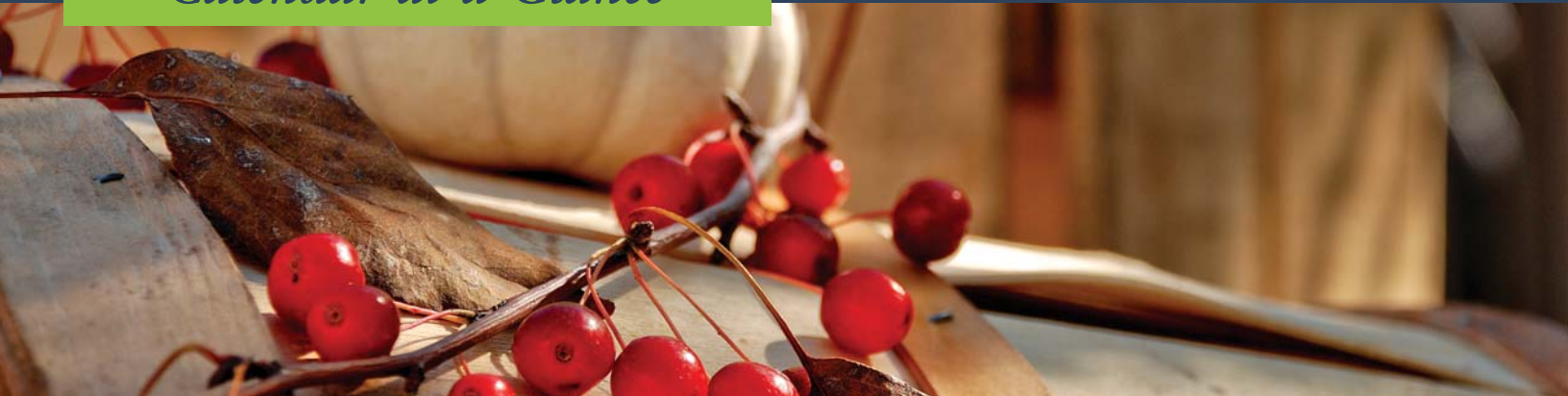
White Fall Pumpkin.