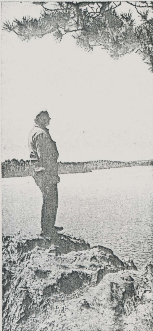
A 20th century voyageur gazes across the azure waters of a BWCA lake from an island formed of volcanic tuff, one of a multitude of rock types found in this country.