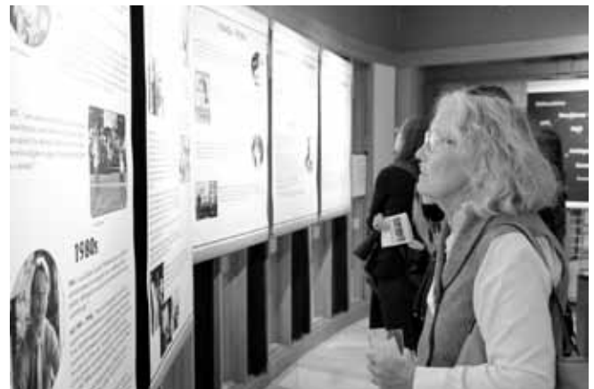
Gallery exhibit visitors may view the timeline, watch videos or examine display cases.

We are deeply honored for the opportunity to continue our ground breaking work in adding transgender voices to the archive. Our deepest thanks to Tawani Foundation, our donors and all who have participated by