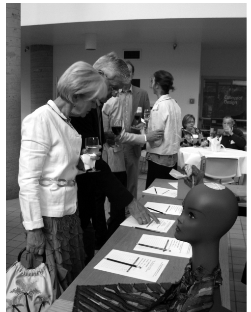
Garden Party guests had many unique items to bid on during the silent auction.