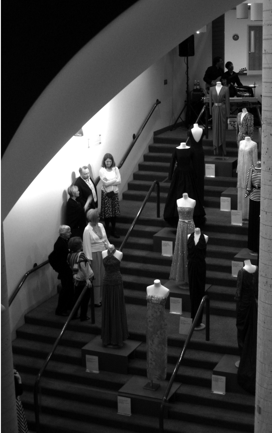
A cascade of beautiful evening dresses recently donated by Lally Weymouth (daughter of Washington Post publisher Katherine Graham) was a focal point of the Friend's Garden Party.