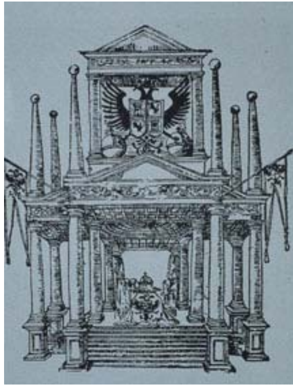
Fig. 1. Túmulo Imperial . From Francisco Cervantes de Salazar, 1633.