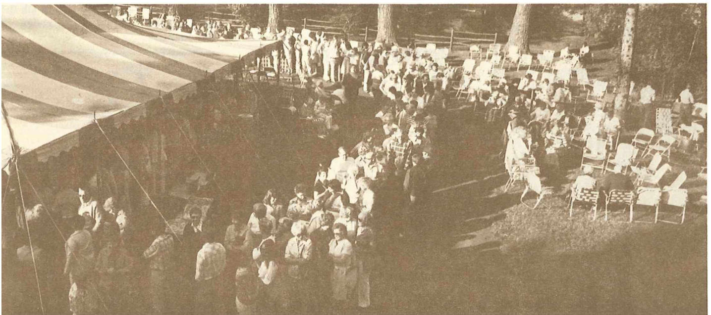
First Docent Picnic August 13, 1980.

This water supply system uses gravity. It was designed to blend with its surrounding environment and today is still very unobtrusive. The interesting aspect about the system is that it has operated efficiently for nearly 75 years.