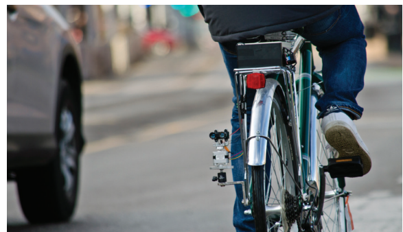
The collision-warning system uses laser sensors mounted on the bike for rear collision avoidance.