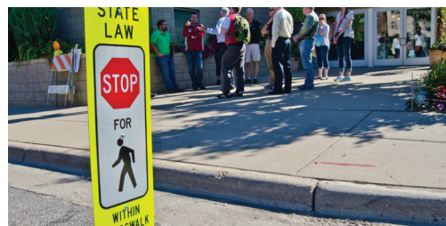
PWX conference attendees discussed an R1-6 sign gateway.