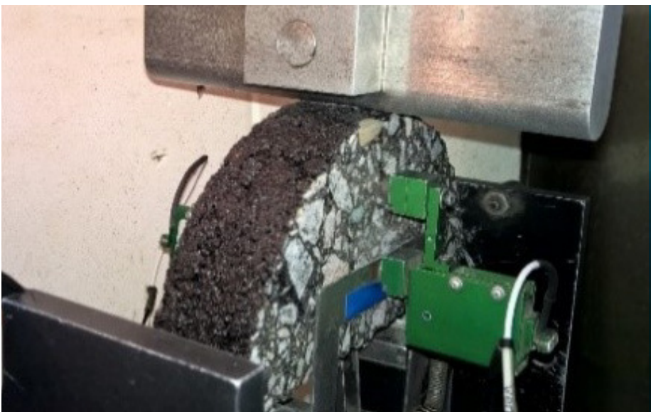
This test applies pressure diametrically on an asphalt pavement "puck" along the axis of a 6-inch pavement cylinder to measure susceptibility to cracking at low temperatures.

MnDOT will share test results with its research partners and include them in the overall examinations of the MnROAD test cells. Researchers recommend repeating these tests with the pavement cells periodically to correlate field conditions and tested mixture performance over time. In addition, MnDOT will consider some of these testing methods and findings for its continuing effort to develop a performance-based balanced mix design approach for asphalt pavement.