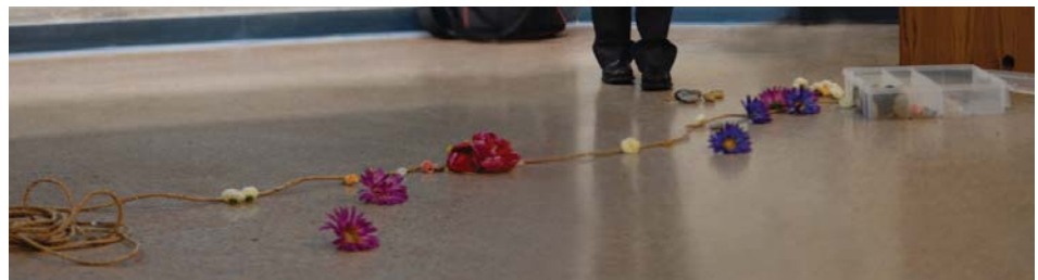
Lifeline approach used in the NET intervention