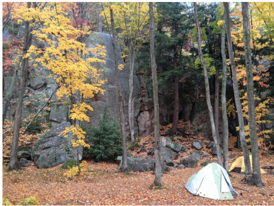
Weekend in the UPPER PENNINSULA