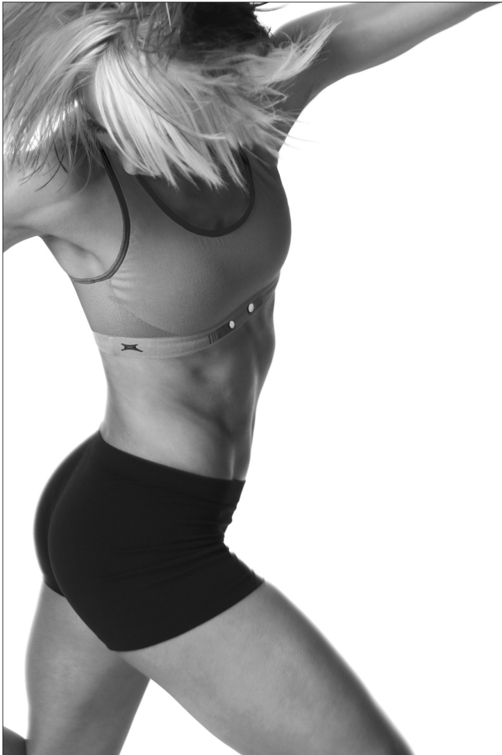
The NuMetrex™ Heart Rate Monitoring Sports Bra has tiny electrodes woven into its fabric that can detect heart rate and display the result on a watch. In addition to the bra, Textronics Inc. makes a heart monitoring shirt for men.

May 15–July 17, 2008, GOLDSTEIN MUSEUM GALLERY