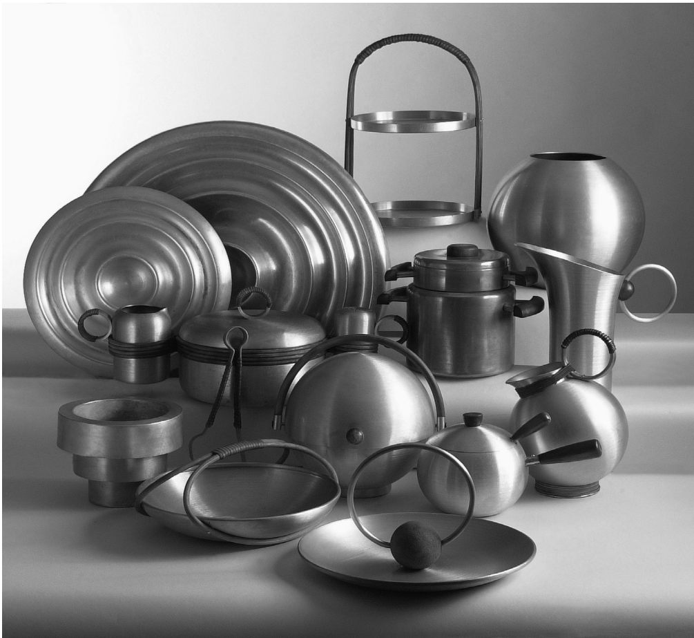
A variety of items produced in spun aluminum, designed by Russel Wright in the 1930s, including pitchers, vegetable servers, a double boiler and relish trays.