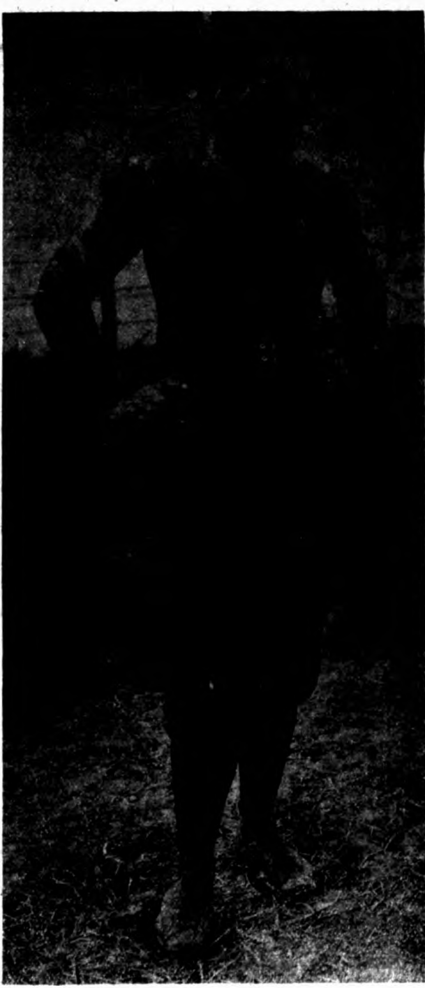
Wanted on, Captain of Nebraska Team 1902.

Browning, King & Co's 415, 417, 419 Nicollet Ave., MINNEAPOLIS. Seventh and Robert Sts., ST. PAUL.