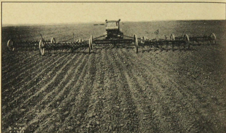
Fig. 2. Preparing a Seed Bed for Flax in Montana.

Flax growers of Montana should strive for higher acre yields in an effort to overcome partially the handicap of long hauls and high freight rates. Montana's flax yields per acre are low but can be raised easily since the crop responds readily to good cultural methods. The use of approved methods and efficiency in all operations should be emphasized, as increased yields without a proportionate increase in the cost of production results in greater net profits per acre.