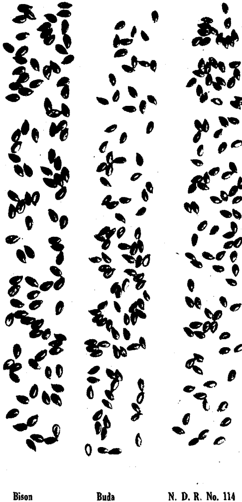
Fig. 1. Seeds of Bison Variety are Approximately One-Third Larger Than Buda and North Dakota Resistant No. 114. One-Third More Seed per Acre of Bison or Other Large Seeded Variety Must Be Sown To Obtain Desired Stand of Plants

Bison or Buda. This seed plot should be planted on well-worked, old, wilt-producing land, so if there chances to be any admixture of non-resistant flax in the seed, the soil of the seed plot may destroy the non-resistant plants.