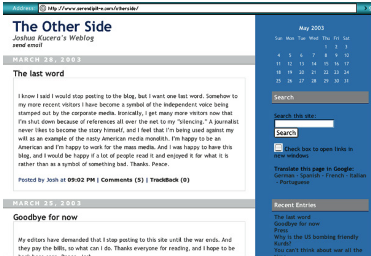
Figure 1: The Other Side, Joshua Kucera's weblog. http://www.serendipit-e.com/otherside

The day after that article came out, March 25, 2003, TIME demanded Josh stop posting to his blog, just as CNN's Kevin Sites had also been forbidden to post to his blog as it started gaining popular acclaim during the war. The screenshot below shows Josh's two final posts on the permanent site archive.