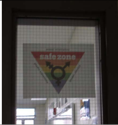
Figure 4.3 Brayden's Safe Zone Sticker

but also for disaggregated samples. This disaggregation is where students learn the variations between groups such as gender and sex or race. For example, Brayden described a project his students did in statistics and gave an example of a time a student used an LGBTQ topic: