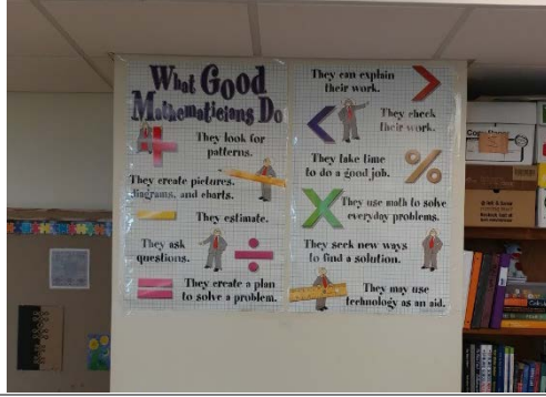
Figure 4.4 Wendy's What Good Mathematicians Do Poster

Wendy admitted to struggling to find specifically LGBTQ-inclusive problems for Algebra II and AP Calculus BC. For example, in AP Calculus BC, I observed the students completing multiple procedural problems on a worksheet. When the students finished the problems, they each wrote a solution, including all the steps, on the whiteboards in order to share the information with their peers. Yet, Wendy was proud of her work to find relevant data sets for inclusive problems in Functions Statistics and Trigonometry, stating: