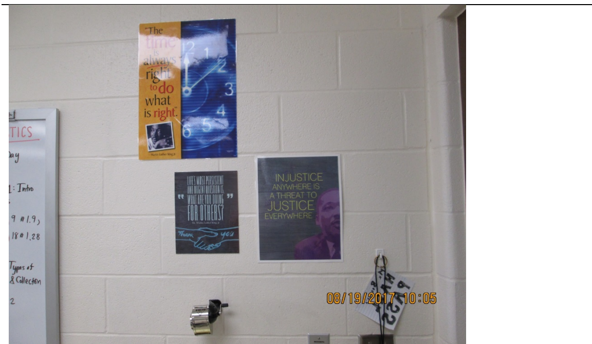
Figure 4.2 Brayden's Social Justice Posters

we'll grade the homework...then I will go into the new lesson ... I am still pretty set on doing the old school style of lecture." The type of problems I observed for Algebra II were the simplification of algebraic expressions, solving algebraic equations, and solving algebraic inequalities. Therefore, while on occasion Brayden used algebra problems he created involving a family with either two moms or two dads, he felt that the inclusive curriculum was more explicit in statistics than in algebra. In many statistics problems, students are asked to calculate central tendencies and correlations not only for the sample,