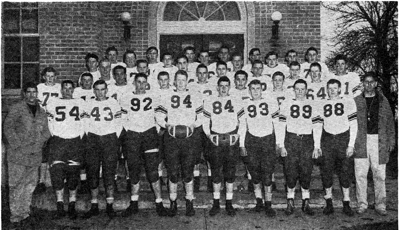
NORTHWEST SCHOOL FOOTBALL TEAM