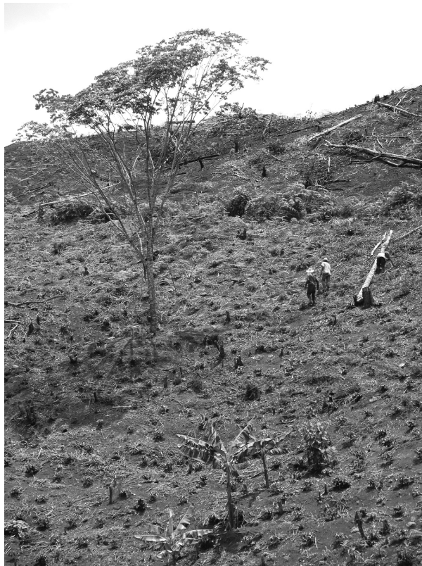
Figure 2.3. High-elevation coffee planted in place of forest in the buffer zone of Pico Pijol National Park, Honduras.

Future priorities for research should address key gaps in the understanding of the ecology of