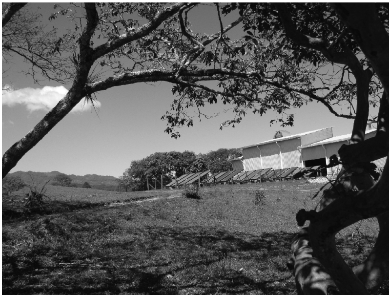
Figure 2.1. Solar-hybrid coffee drying facility in Subirana, Honduras. Panels in foreground collect thermal energy, which is circulated through drying towers located in the building behind.

Integrated Open Canopy (IOC) coffee represents an example of a refinement of an existing approach to biodiversity conservation (Arce et al. 2009). Like other forms of agroforestry, IOC coffee cultivation systems seek to use financial incentives to influence farmer behavior to maintain