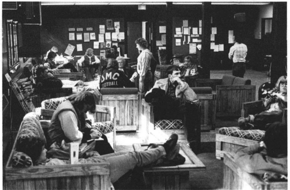
A place to relax.