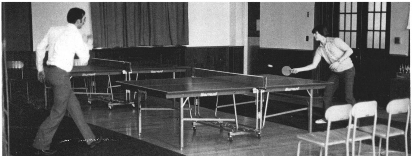
A place to exercise.