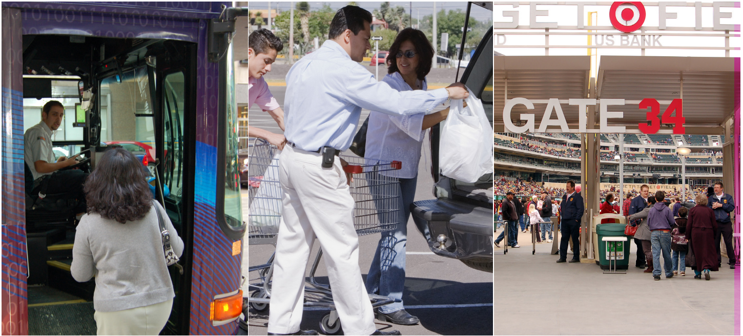
Infrastructure is about people—making sure they can get to activities they need and want to do.

presentation, Brookings Institution fellow Adie Tomer offered highlights from the institution's Moving to Access Initiative, which visualizes challenges of the current mobility model, impediments to adopting an accessibility-focused approach, and a vision for where metro areas can go from here.