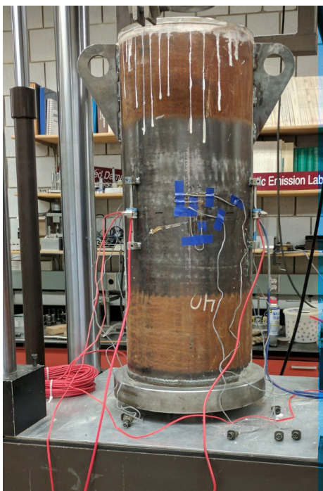
A section of concrete-filled steel piling was placed in a high-capacity load frame.