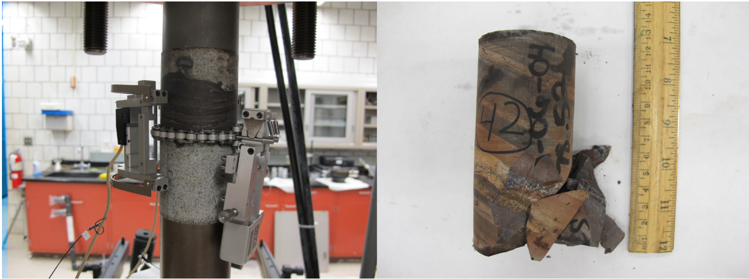
Rock samples were instrumented along the length and around the circumference of the cores.

For a bridge project in northern Minnesota, MnDOT designers needed data on “hard” rock that was too strong for the agency’s standard testing approach. To obtain the data, they turned to researchers in the Department of Civil, Environmental, and Geo- Engineering (CEGE), who used a high-capacity load frame at a campus lab to test rock samples from the project site.