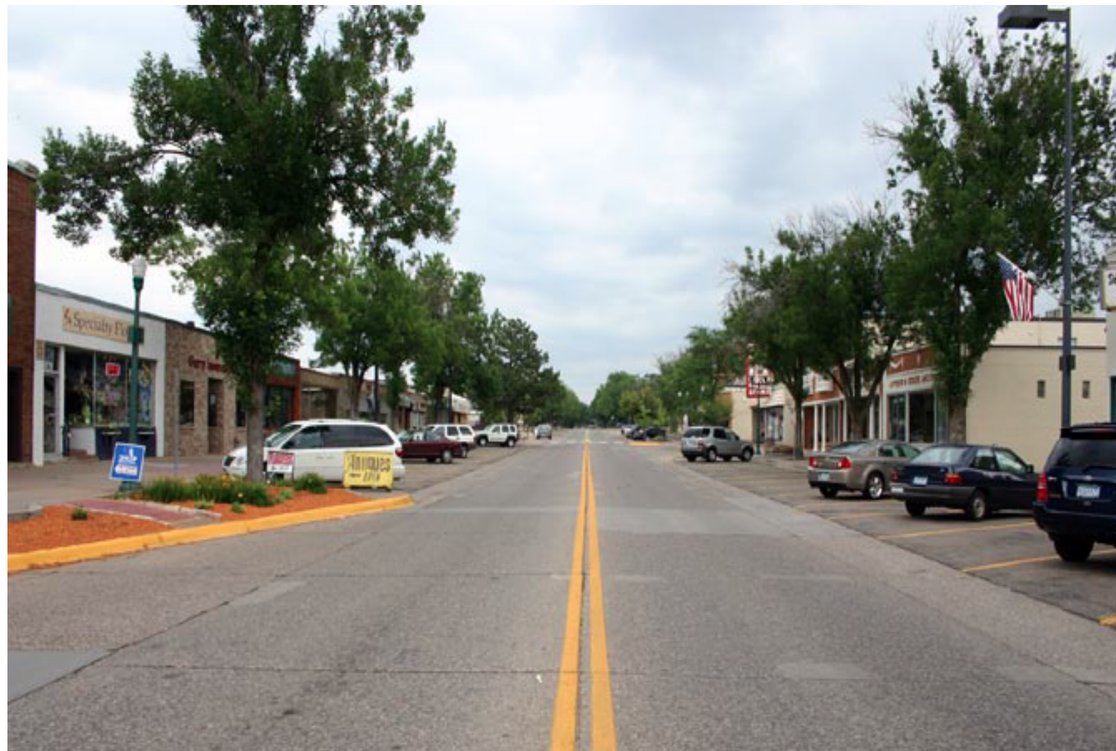
Photo from North Saint Paul Downtown Design Manual

Is the City of North Saint Paul providing adequate access to necessary services for its growing older adult population?