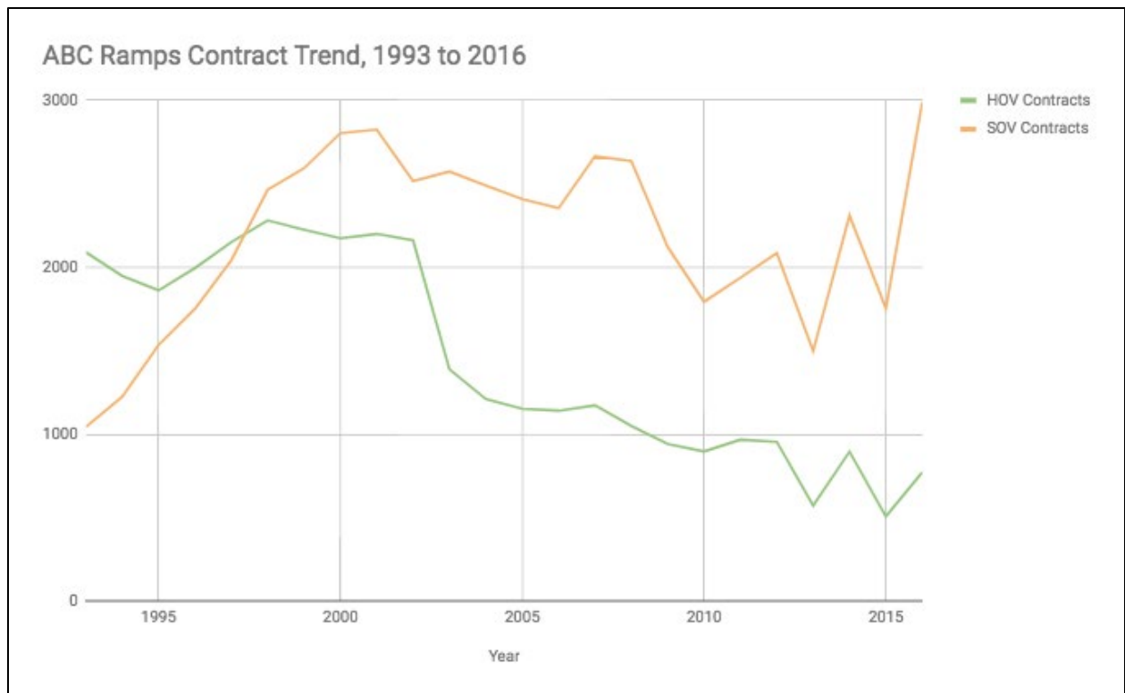
Figure 1 Carpool and Monthly Contract Trends 1993 - 2016

Despite the price drop and extra incentives, this extra layer of verification led carpool contracts to drop by half. As of 2016, the number of carpool contracts hasn’t neared its initial level since the drop off in 2002. SOV contracts have since increased, while HOV contracts have decreased with the ratio at this point about four SOV contracts for every carpool (Figure 1).