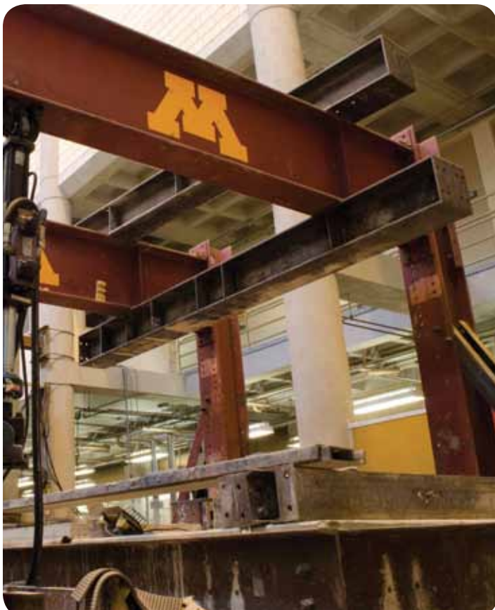
Lab space and faculty hires are being directed to key research areas.

Finally, the building itself is being renovated and some laboratories are being remodeled, as is the second floor student lounge, through the generous support of WSB & Associates and the College of Science & Engineering. The unique underground structure received the 1983 outstanding civil engineering achievement award from ASCE. I look forward to inviting the community to visit sometime in December 2013 to celebrate the 30-year anniversary.