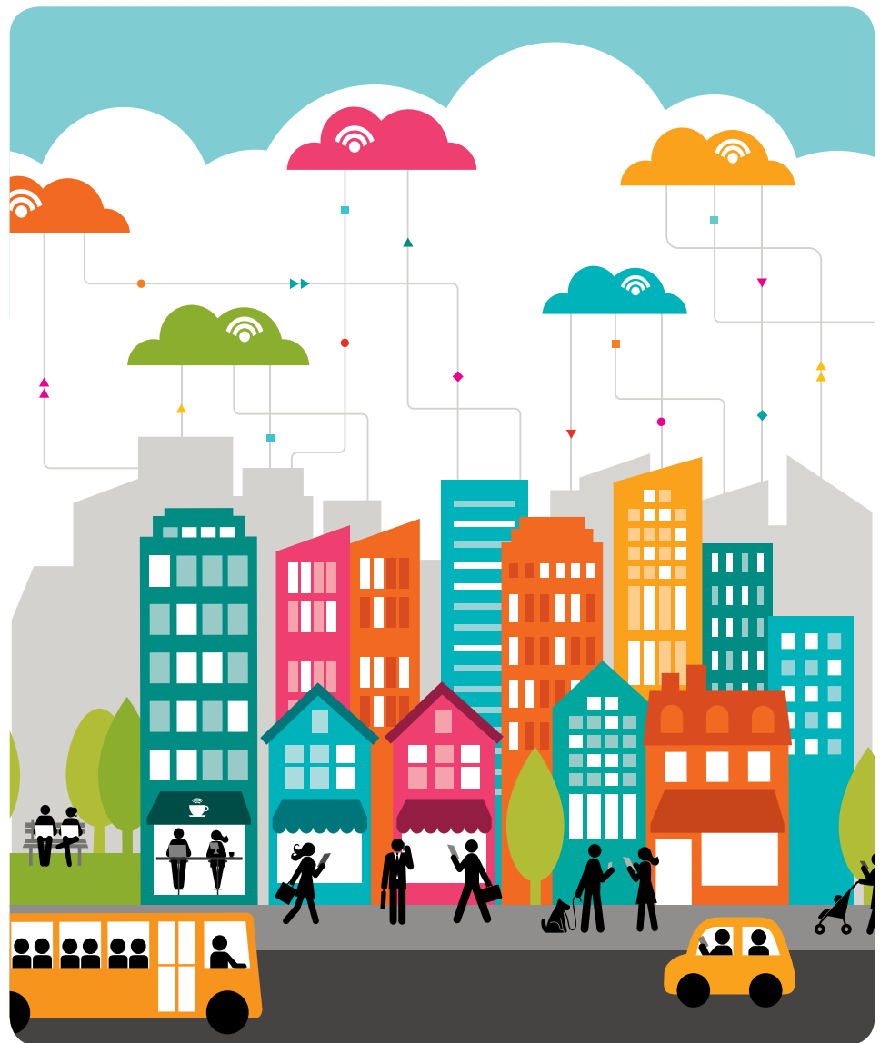
Levinson predicts improved accessibility, more real-time transportation data, and cleaner cities.

The challenge, Levinson says, is that these issues are often governed by different organizations. "Land use is generally locally managed, and transportation is funded at least in part by the federal and state government... They have different objectives," he says. Improvements in accessibility will require better coordination and alignment of these transportation and land-use objectives.