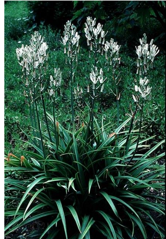
Albuca nelsonii —Natal albuca

http://www.bulbsociety.org/GALLERY_OF_THE_WORLDS_BULBS/GRAPHICS/Albuca/Albuca_nelsonii/Albuca_nelsonii.html