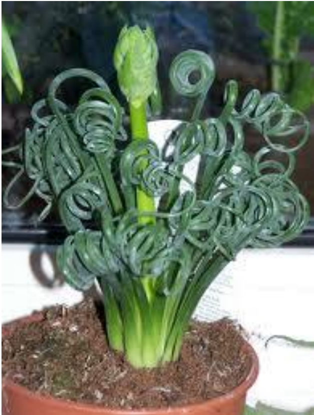
Albuca spiralis —Frizzle sizzle

http://ivynettle.wordpress.com/2011/05/22/oooh-shiny-curly/