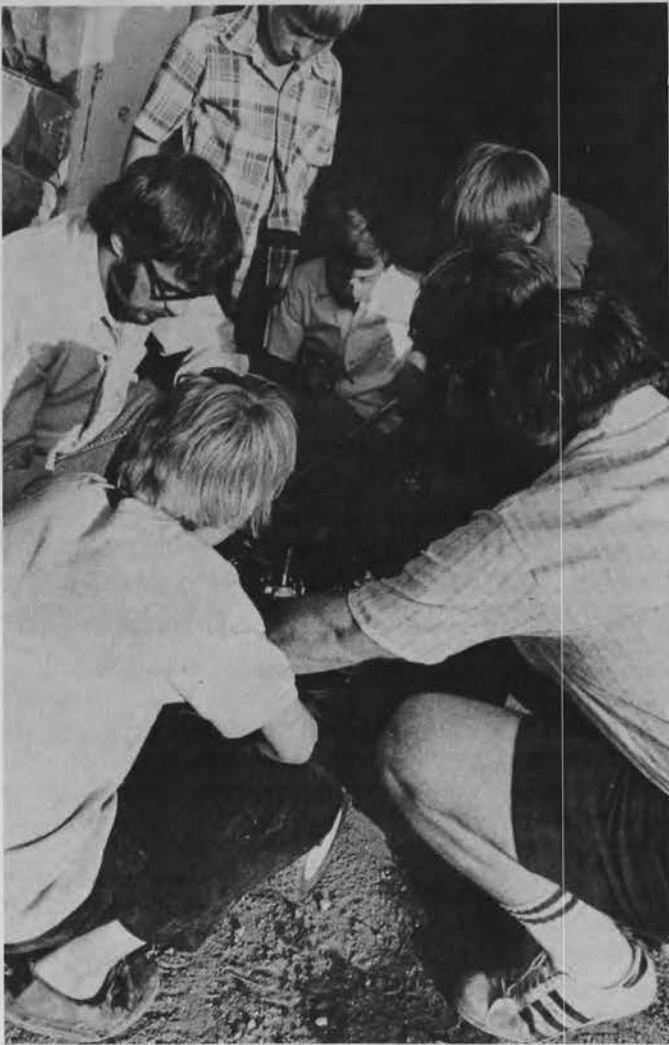
Group instruction at project meetings is best when centered around members' common interests.