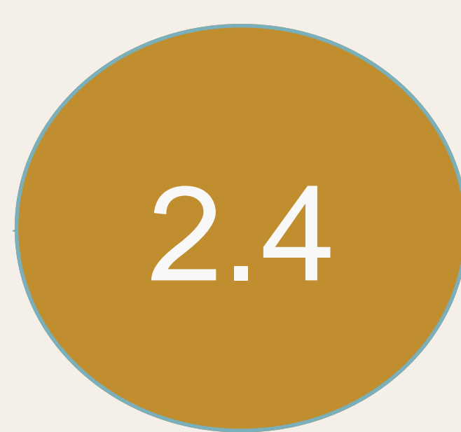
Fig. 2: Average # days to visit the fair (n=1036)