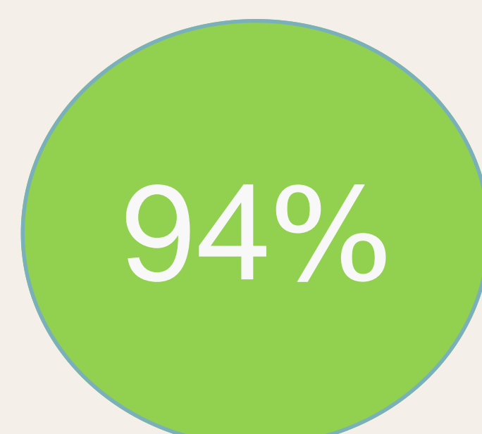
Fig. 3: % of attendee survey respondents who were satisfied or very satisfied (n=1039)