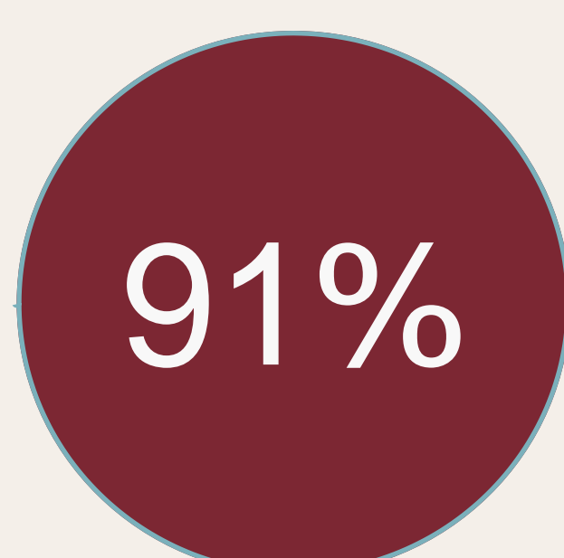
Fig. 1: % of repeat attendees (n=1058)