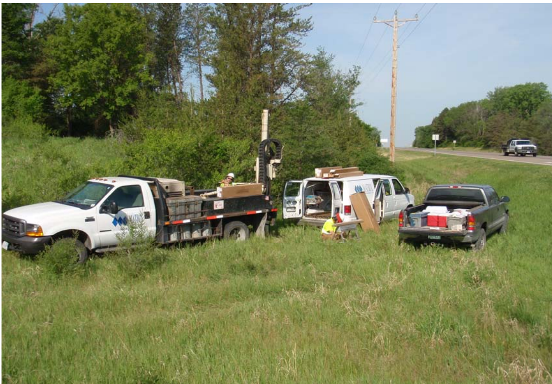
Photo 14 Setup at SOC3-GP2