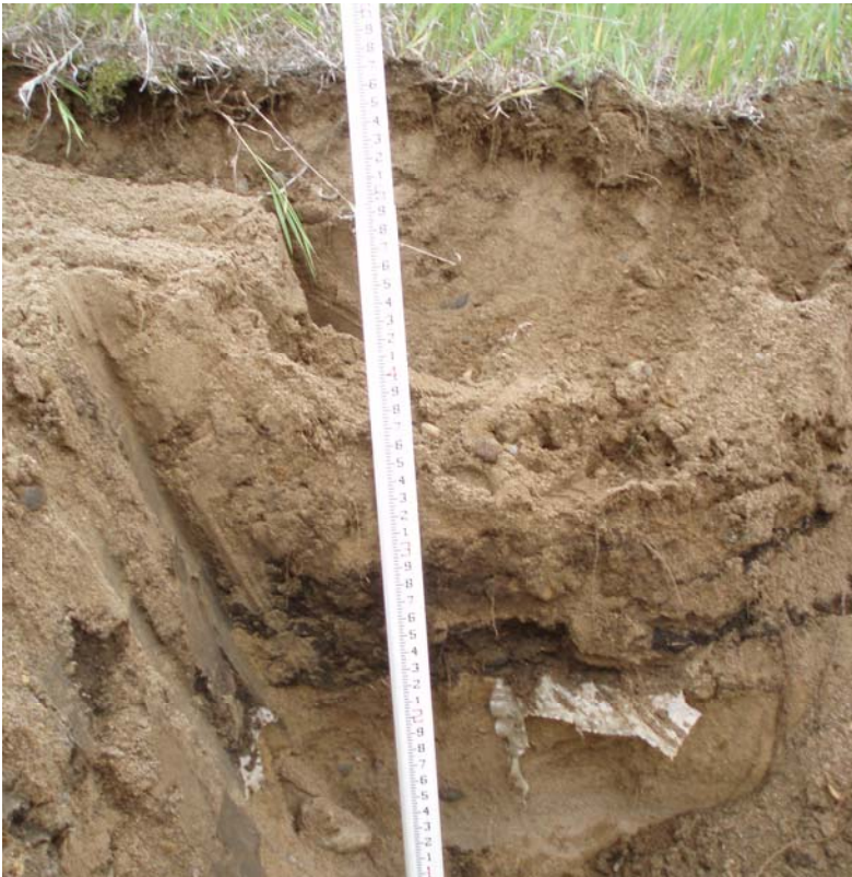
Photo 6 Former Lagoon Liner at SOC3-TT2