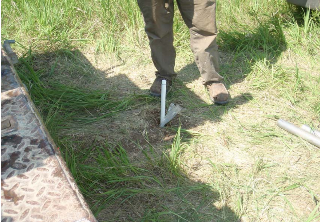
Photo 17 Temporary well at SOC3-GP2