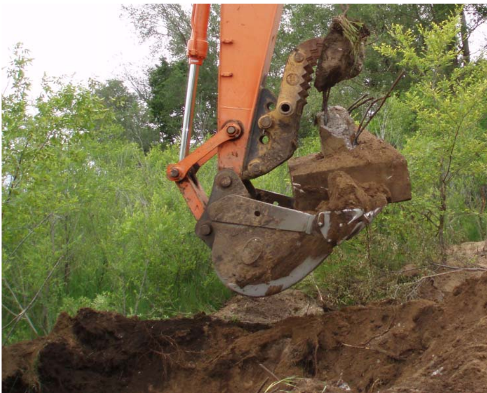
Photo 8 Debris at SOC3-TT9. Debris encountered during excavation included concrete, metal, and ceramic.