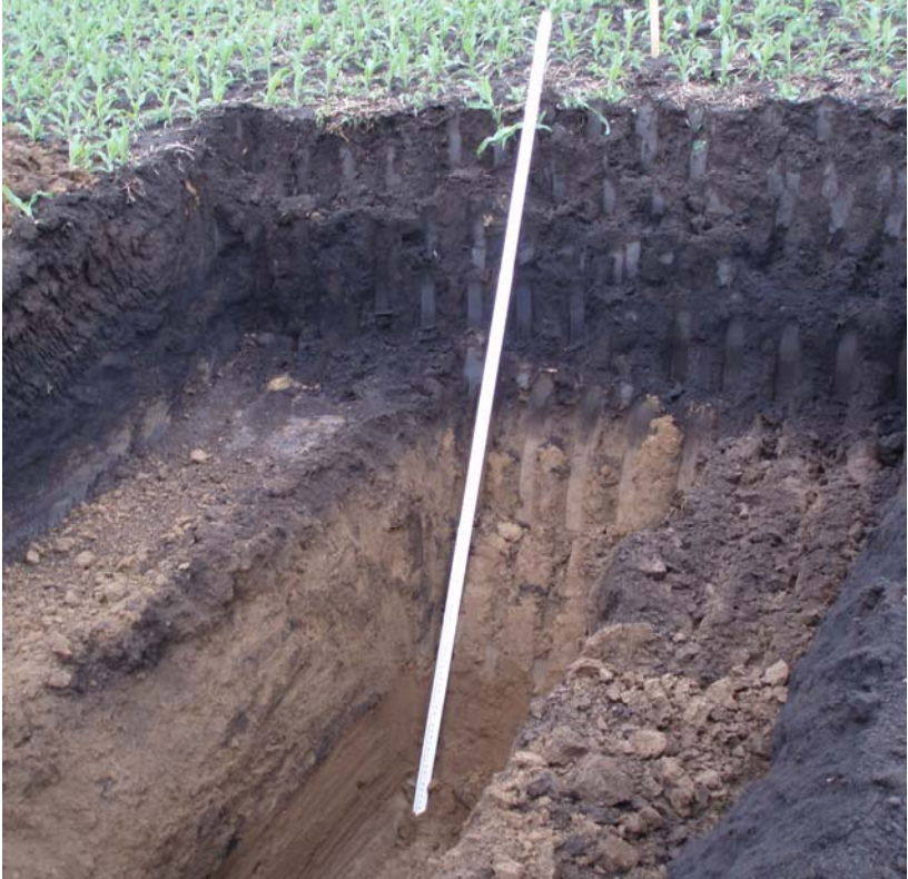
Photo 5 SOC7-TT4 Sidewall