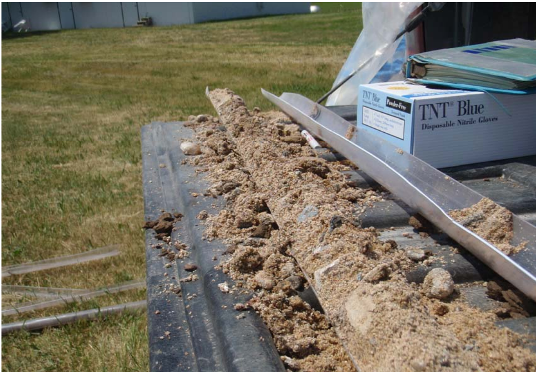
Photo 12 Outwash at SOC3-GP3