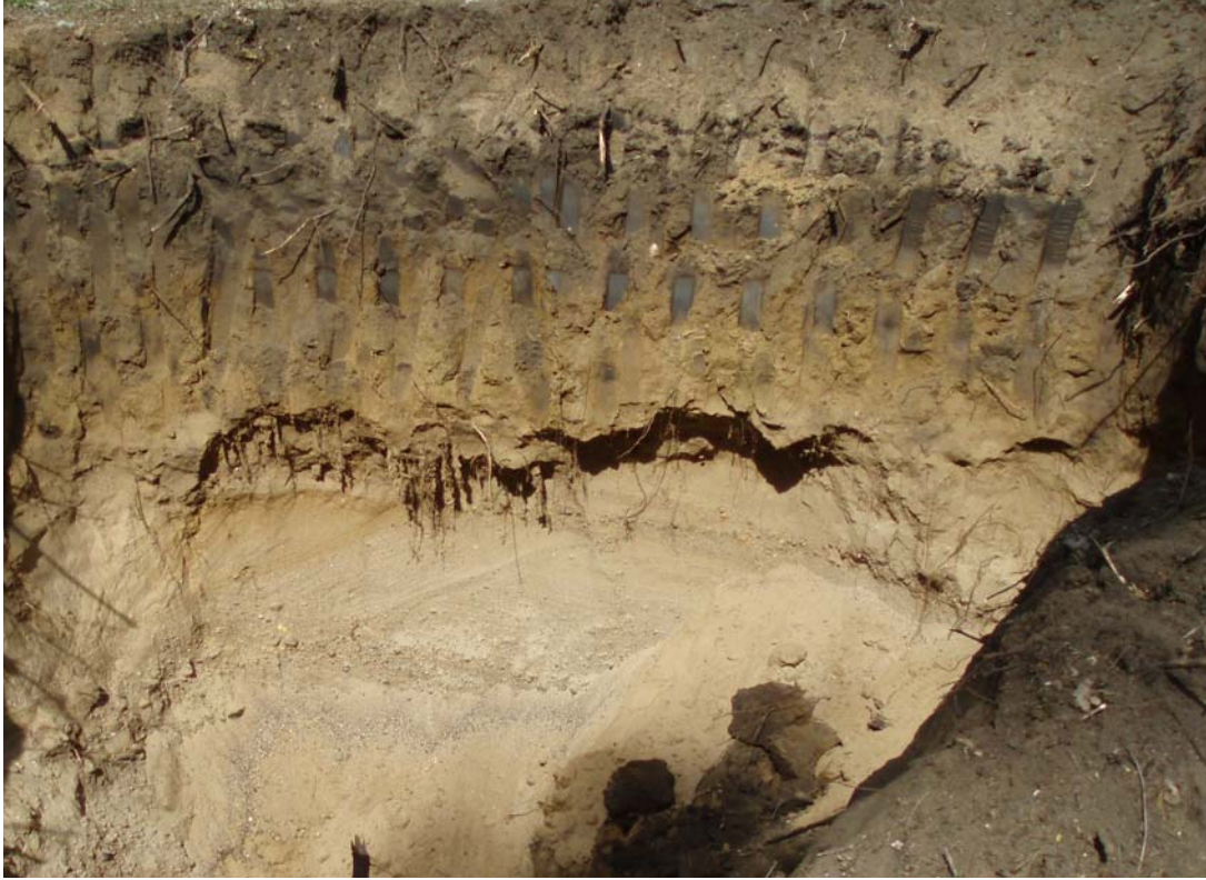
Photo 3 SOC3-TT16 Sidewall