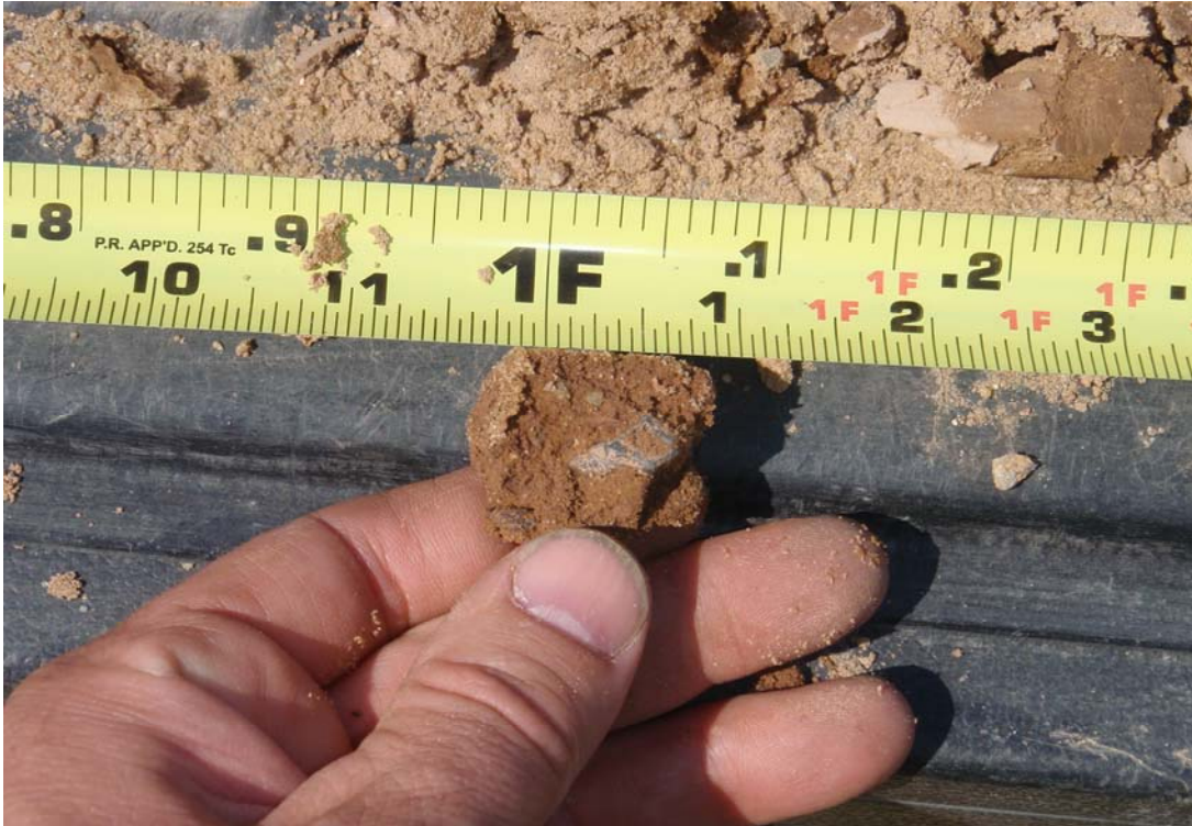
Photo 13 Diamicton till at SOC3-GP3