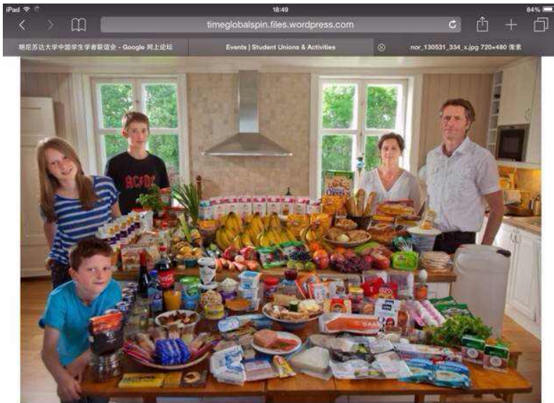
the Hungry Planet