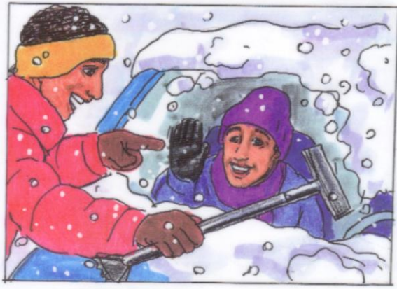
The Snow Day story

Appendix 2: Materials for the comparison task