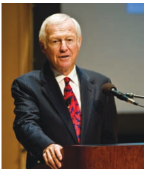
Harvey Mackay inspired students and professionals when he spoke in Duluth.

Your Head to Get Your Foot in the Door: Job Search Secrets No One Else Will Tell You.” All LSBE juniors and seniors, plus all attendees, received a free copy of the best-selling book, courtesy of LSBE, maurices, Richard S. Brown Family Foundation, APEX, and Anderson Agency.