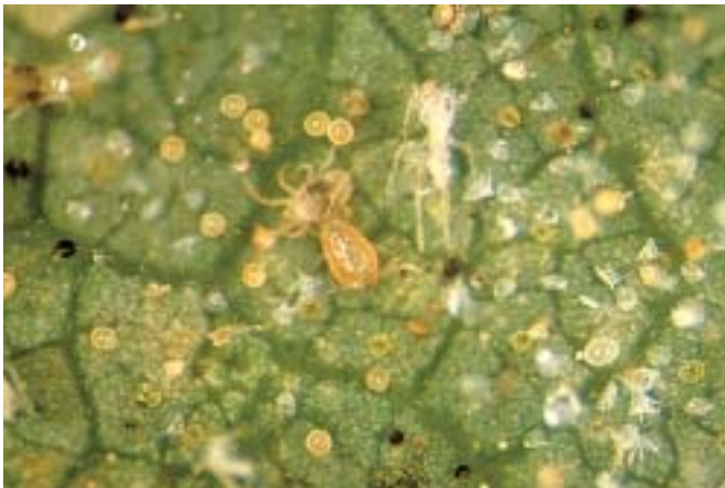
Predatory mite in spider mite colony. (W43)

Prey species: Although these mites almost always prey on other mites and small insects, many can also feed on honeydew or pollen during times of prey scarcity. Many phytoseiid mites are generalists, but a few have specific prey requirements. Phytoseiids are very effective control agents due to their short generations (1 week), high fecundity (40–60 offspring per female), and hearty appetites (20 spider mites/day while developing and 10/day for 2–3 weeks as an adult). Phytoseiulus persimilis is a specialist mite that controls web-spinning mites such as the twospotted spider mite.