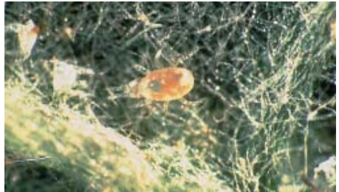
Phytoseiid mite predator of spider mite. (300)