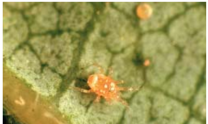
Phytoseiid mite predator of spider mite. (299)