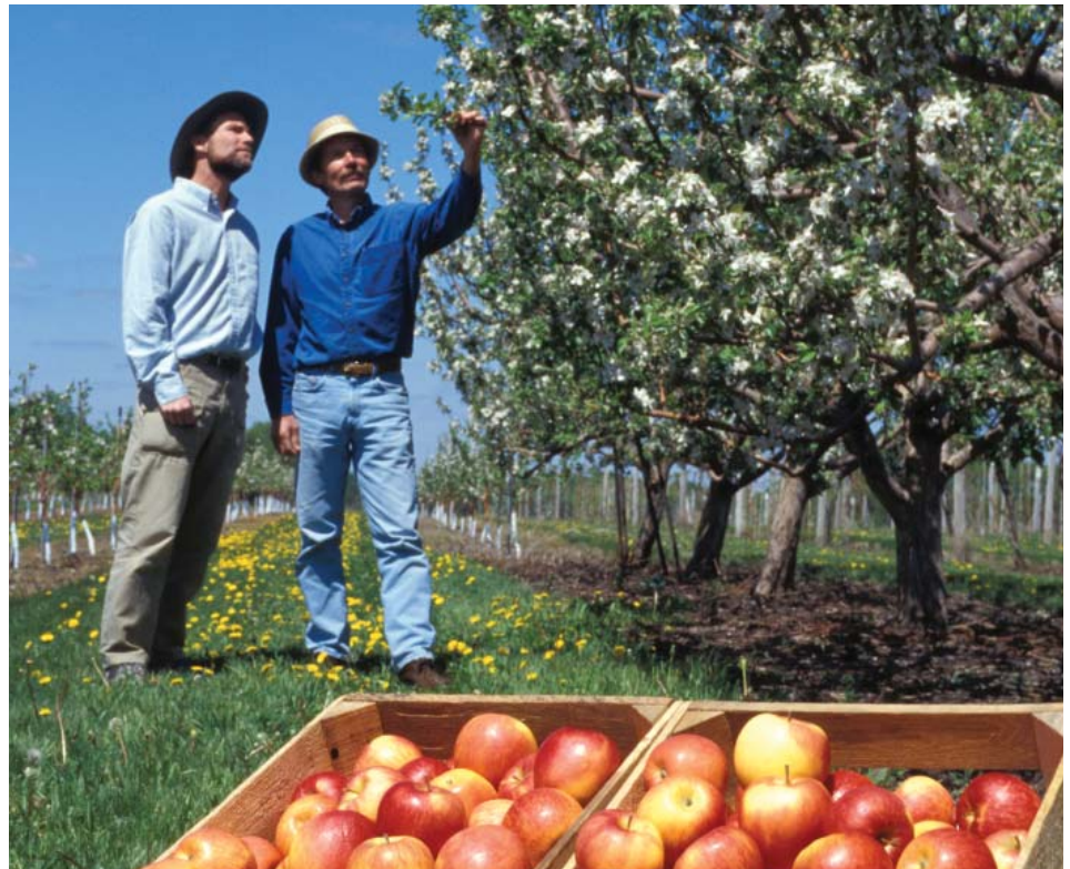
Honeycrisp Apple Tree.