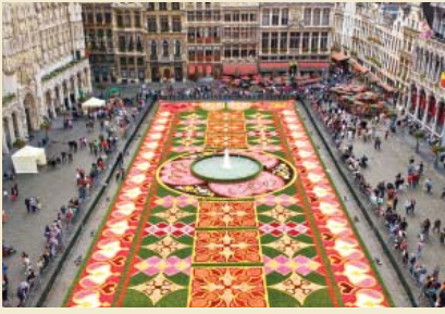
Gaston Batistini, Labo River.