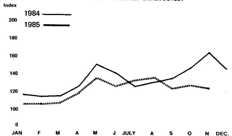
DULUTH BUSINESS INDEX (1967 = 100) (SEASONALLY UNADJUSTED)