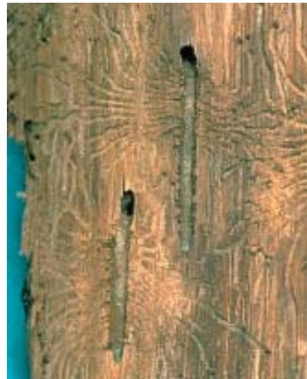
Galleries in elm tree caused by smaller European elm bark beetle. Larger main galleries are adult egg-laying galleries. Smaller galleries are larval-tunneling galleries. Smaller European elm bark beetle main egg-laying galleries run with the grain, while main galleries of native elm bark beetle run against the grain. (104)

Physical control: Trees can be saved by eradicator pruning, if the disease is detected early. Infested trees and diseased or damaged branches should be removed, burned, or buried. If you suspect a tree has Dutch elm disease, remove a recently wilted branch and strip off the bark. Locate the wilted branch and remove the bark until clean sapwood (not discolored) is found. Remove the branch approximately 10 feet below the junction of clear and discolored sapwood. Be sure to disinfect pruning tools in a 10% household bleach solution. Eradicator pruning may result in the loss of a major tree limb. Nevertheless, many American elms can be saved by this pruning method. Infested trees that cannot be saved should be removed, burned or buried to prevent further spread of the patho-