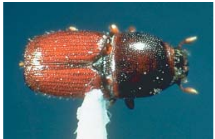
Smaller European elm bark beetle adult. (103)

gen. If wilt occurs in more than 25% of the tree crown, the tree cannot be saved. Check to see if adjacent elms are within 25–50 feet before removal. If so, disrupt root grafts by trenching before cutting the tree down. It must be assumed that all American elms within 50 feet of a diseased tree are root-grafted. Trenching is a relatively quick and effective means of breaking root grafts. Mark a line or arc at the midpoint between two adjacent trees. The line or arc should extend such that all potential root grafts can be broken. A straight line may be more convenient on tightly spaced trees, but the line should extend beyond the tree drip line. Dig a trench 24 inches deep following the line or arc using a trencher, vibratory plow, or spade. Be sure to check with local utilities before