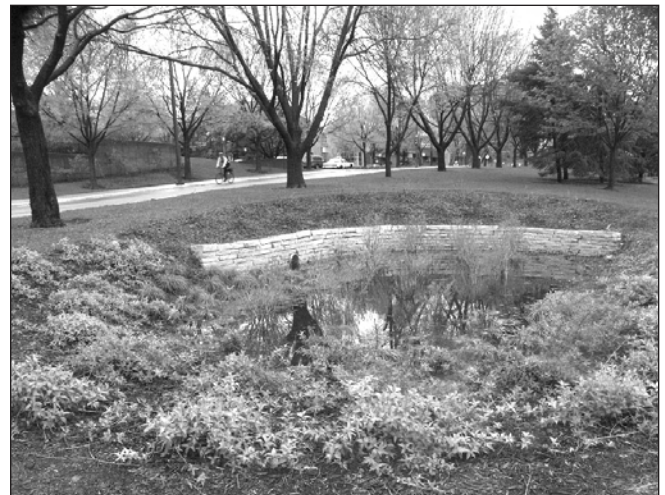
This rain garden was installed on Gortner Avenue in St. Paul to help manage stormwater while improving campus sustainability.

Although this year’s meeting focused on St. Paul, University plans also include the Minneapolis Campus. As a first step,