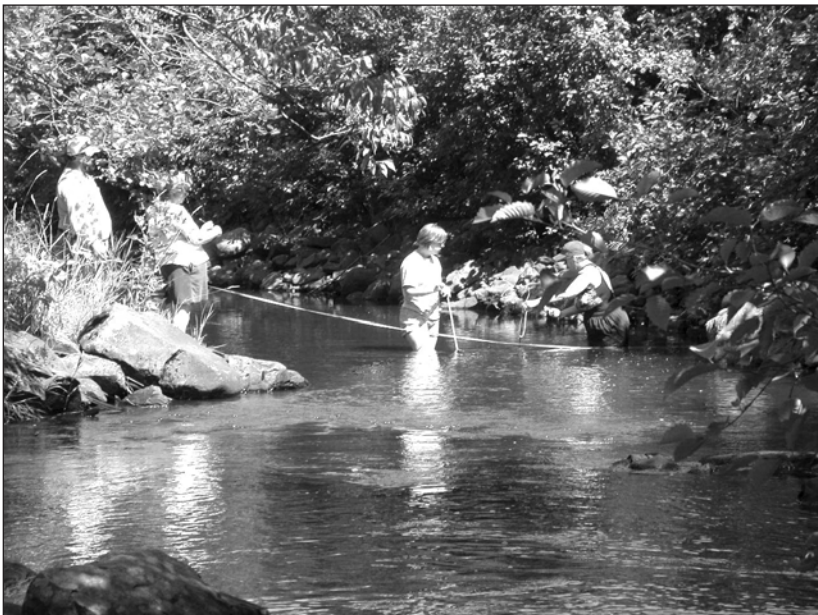
Students in the restoration program will visit restoration field sites to gain practical experience.

The one-year program will teach graduate students to blend engineering and physical, biological, and social sciences to prioritize, design, implement, and evaluate stream restoration projects. After completing an introductory course in stream restoration, students will select four additional courses from four theme areas—River and Floodplain Science and Engineering, River and Floodplain Ecology, Water Quality, and Water Policy and Management. To give students a hands-on experience, a one-week short course will be held in the summer. Students will visit recently completed and on-going stream restoration field sites to see how the stream restoration science and engineering learned in the classroom is applied to real-world restoration problems. The certificate can be a stand-alone qualification or part of a M.S. or Ph.D. program. For more information regarding the Stream Restoration Certificate Program, visit the program Web site at www.nced.umn.edu/sr_certificate_uofm/ .