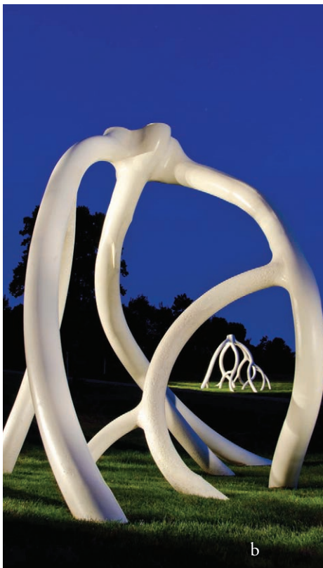
a) A pair of bronze root sculptures titled "Romeo & Juliet".