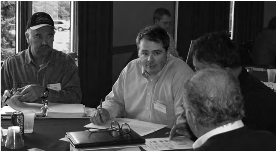
Participants in the Project Closeout session worked through an exercise on FAA fund request forms.