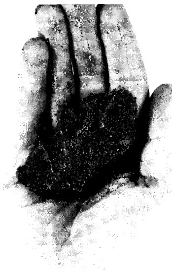
Figure 6. Cast formed when moist soil is squeezed in the palm of the hand.

Sandy Loam —Contains much sand, but has enough silt and clay to make it somewhat sticky. Individual sand grains can be seen readily and felt. Squeezed when dry, it will form a cast which will fall apart and not form a ribbon, but if squeezed