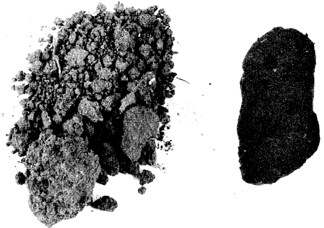
Figure 3. Effect of mechanical action on fine-textured soils.

If soils with a high clay content are compressed or smeared when the moisture content is high, the larger soil pores can be effectively sealed off, further reducing the ability of the soil to transmit water. In a dry clay soil the microscopically small clay plates are linked to create a strong stable condition (figure 3). This condition does not change much when the soil is slowly wetted. However, changes will occur if the moist soil is compacted by equipment such as a backhoe or bulldozer. The clay plates separate and the larger pores are destroyed. In the absence of these larger pores, water movement through these soils is further reduced. This means when on-site waste treatment systems are installed in soils with fine textures, great care must be taken not to smear the soil infiltrative surface of seepage trenches.