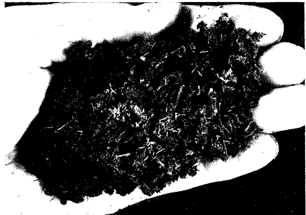
Figure 2. Organic soil (peat)

Organic soils consist mostly of decayed plant material (figure 2) and occur in swamps, bogs, and marshes. Such soils feel very light when dry. Well-decayed muck and peat are powdery when dry but partially decayed peat contains easily identified plant stems and leaves.