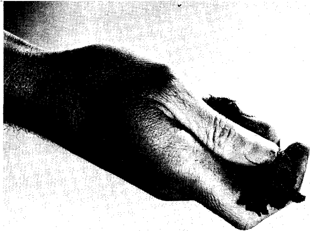
Figure 7. Coarse-textured soil feels very gritty. It is not slick or smooth, formed casts of such soils fall apart when touched.

Minnesota On-Site Sewage Treatment Contractors Association