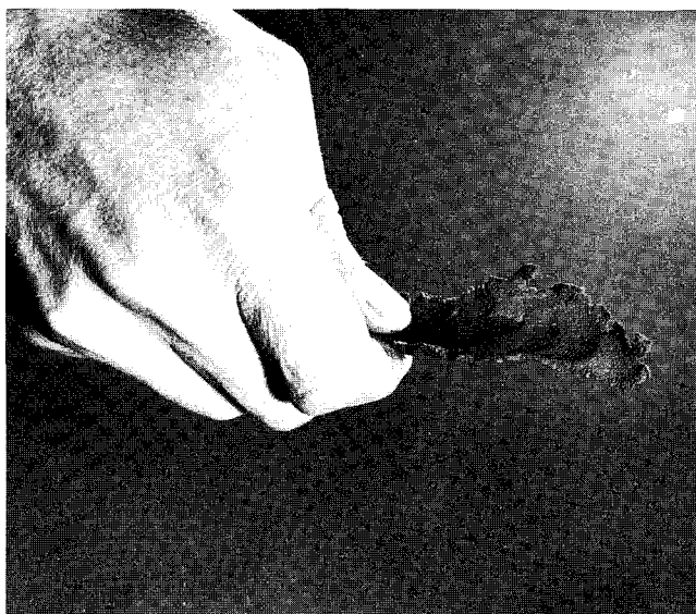
Figure 4. Fine-textured soil forms a long, shiny pliable ribbon. The moist ribbon feels smooth and sticky. Dry clods are very hard.

First, moisten a marble-sized portion of the soil and hand knead it until it is the consistency of putty. Then, squeeze the ball of soil between thumb and forefinger, pressing the thumb forward over the forefinger to push the soil into a ribbon (figure 4). Whether or not a ribbon forms the type of ribbon indicates the textural class.