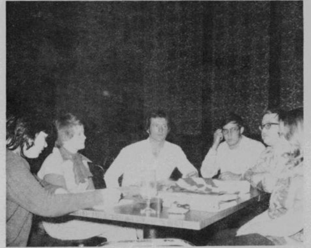
Serious discussion. Alumni Board meeting at the Upper Deck, April 15, 1977.