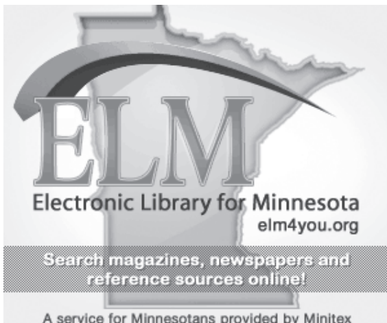
MPR ad for ELM