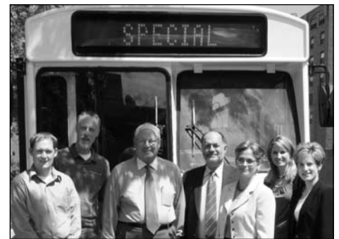
RITA representatives meet with CTS staff.

Staff members experienced some of the bus's systems first-hand by sitting in a second driver's seat equipped with haptic feedback devices that transmit vibration when the bus deviates from its lane. The onboard wireless access point proved to be equally impressive, allow-