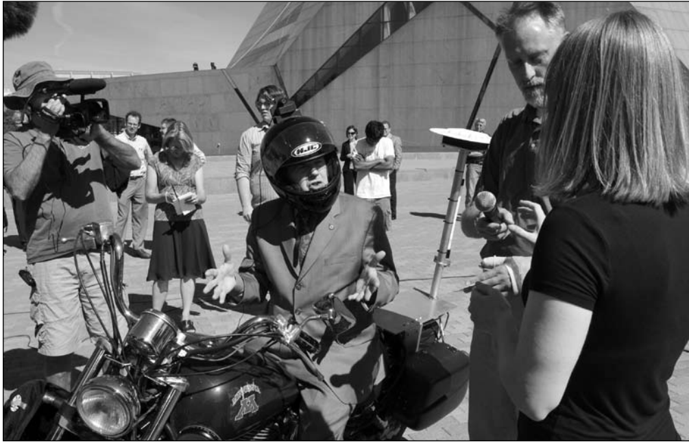
Deputy Secretary of Transportation Thomas Barrett (in helmet) discusses motorcycle safety with researchers Craig Shankwitz and Janet Creaser.

This summer, with gas prices at an all-time high and warm weather beckoning riders to hit the road, motorcycles and scooters are more popular than ever. But statistics from the National Highway Traffic Safety Administration (NHTSA) show that while motorcycles account for only three percent of motor vehicle registrations, they make up 11 percent of total motor vehicle fatalities.