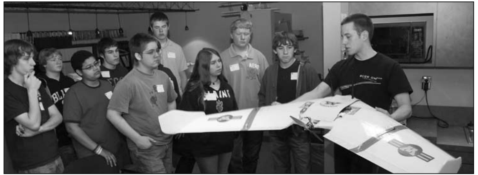
Blaine High School students learn about an experimental uninhabited aerial vehicle.

The visit was structured to give students a perspective on potential careers in transportation engineering and transportation. Students spent time learning about uninhabited aerial vehicles in the Department of Aerospace Engineering, traffic monitoring and