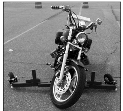
The research motorcycle, showing outriggers deployed to protect the rider.

After consuming the alcoholic beverage or the placebo, the participants rode through a test course developed in collaboration with motorcycle instructors from the Minnesota Motorcycle Safety Center. The course included a variety of tasks, ranging from routine riding situations to emergency maneuvers. Data from both baseline (non-alcohol) rides and rides after consuming alcohol were gathered for each participant, enabling the researchers to compare the