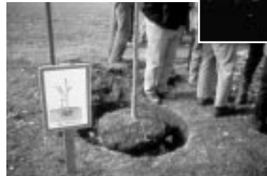
Best planting practices begin with digging an ample hole (above), contrasted here with the old way . . . the smallest possible hole (left).