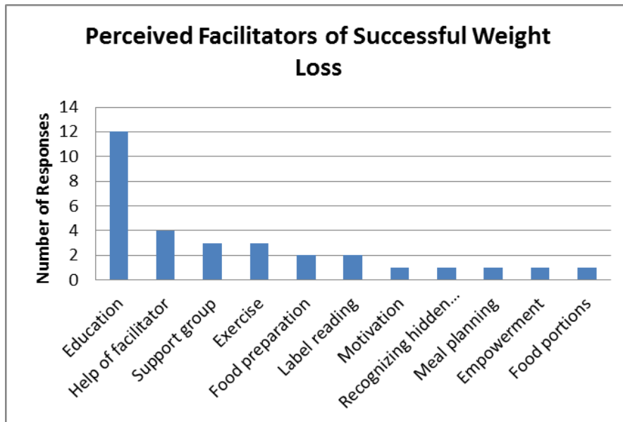
Figure 2. Perceived facilitators of successful weight loss.

Participant-Perceived Facilitators of Weight Loss. Another open-ended question of the satisfaction questionnaire was to identify three perceived facilitators to their weight-loss efforts.