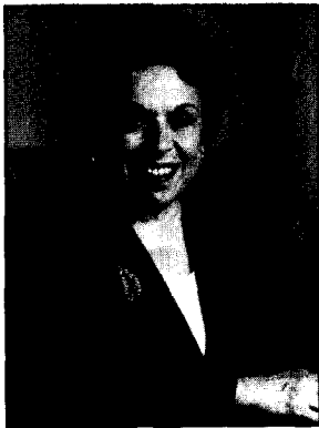
Donna E. Shalala