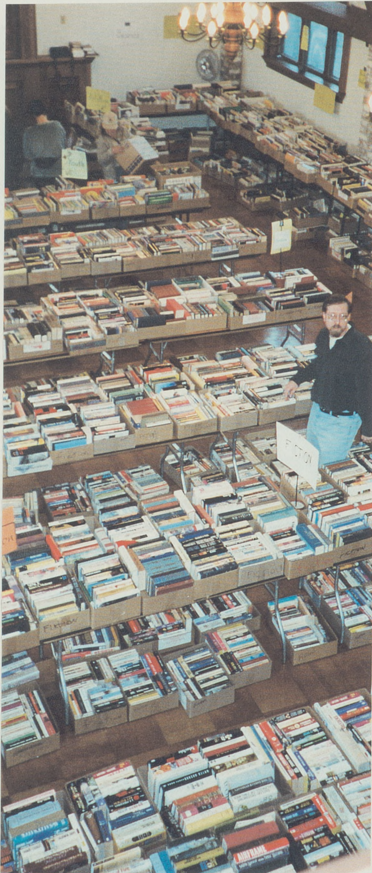
1998 Book Sale.