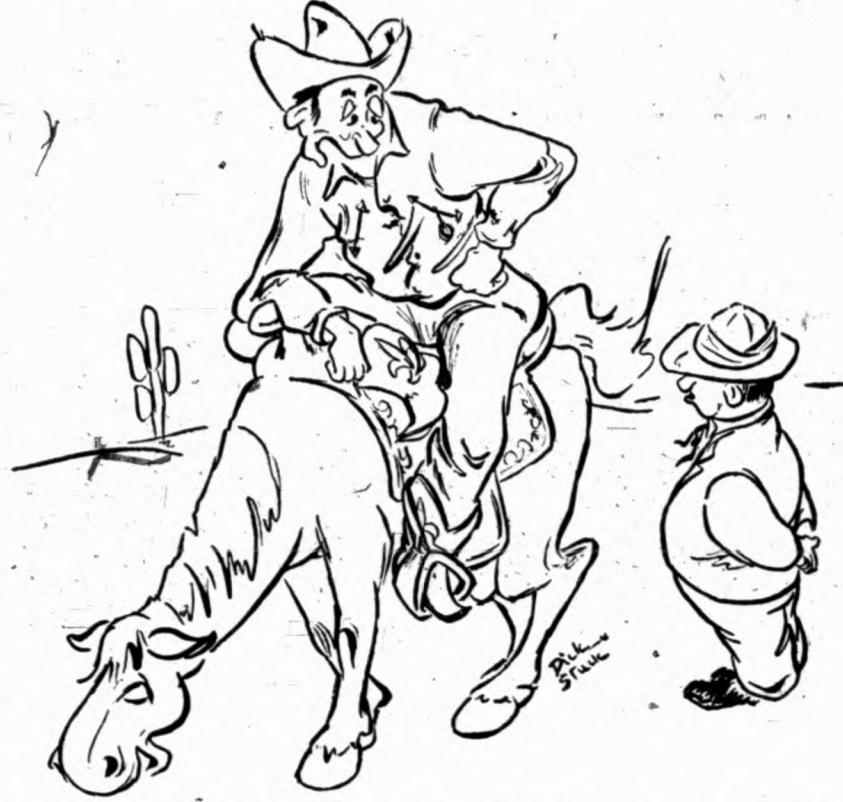
"Am 'Ah now, or have 'Ah ever been a member of WHAT???"